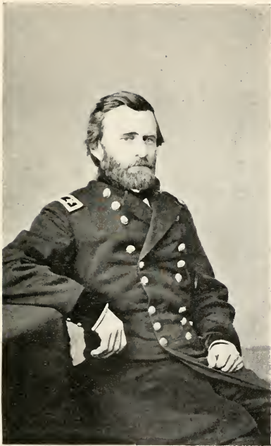
ULYSSES S. GRANT